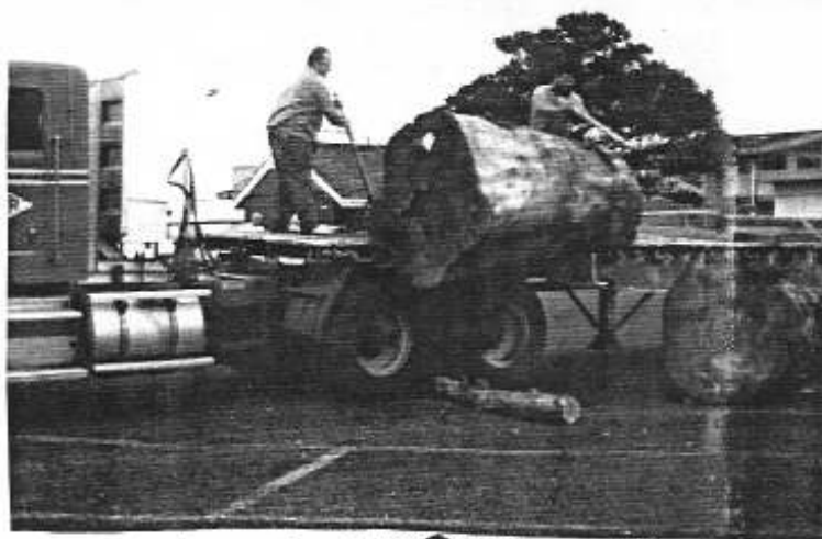
LAST YEAR'S WOOD

For those of you who are flying in, we are working on a van pickup at the airport. More information on that later. Although a rental car would give you greater mobility to see the beautiful Puget Sound Region and the rugged Washington Coast.