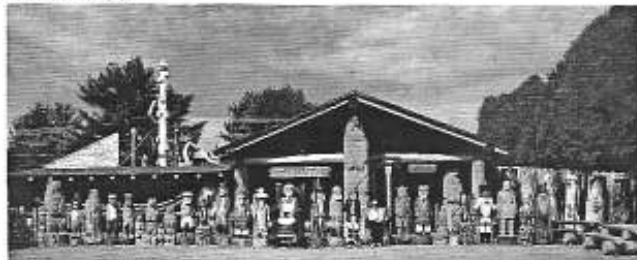
This is a photo of Carl's Wood Art Museum located West of Eagle River, Wisconsin

Send your entries to Timbercrafts, RT 214, Lanesville, NY 12450, Phone 914/ 688-7875, FAX 914/ 688-5873. Watch for the: "Best Shop" photos in the "Cutting Edge"