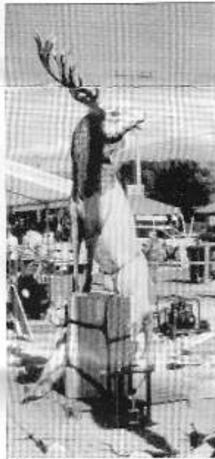
2nd Place and People's Choice "Call of the Wild" by Trace Breitenfeldt