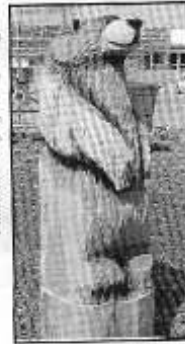
Big standing bear carved by Steve Orme

nice percentage going back to the carver.