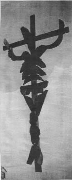
Wood assemblage, Height 108", Width 53", Depth 12".

To be crucified is one of the most painful means of execution created by the human race. It is also a symbol of hope in that suffering can give us the insight to compassion, and extend to each other acceptance, tolerance, and understanding. The Crucifix can be a symbol of truth in that war, starvation, and suffering will no longer be tolerated by the human race. Perhaps, it is unrealistic to consider such ideals, and that such changes are possible. I hope that this work can reach out and help others understand that the CRUCIFIX is a symbol of hope, optimism, peace, and a more loving world.