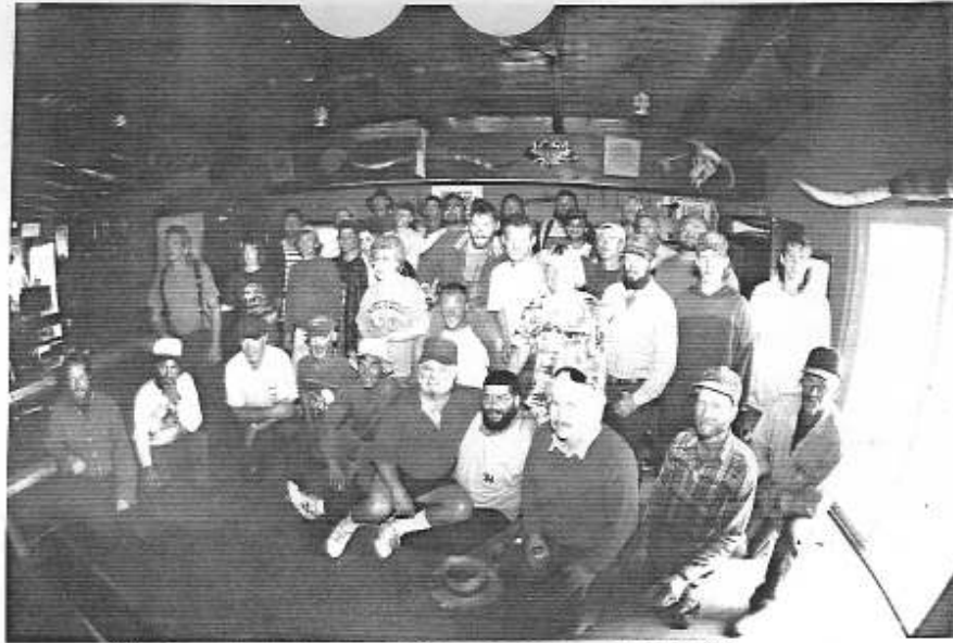
"WESTPORT CARVERS 1994"