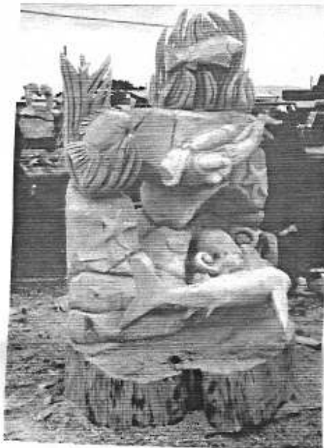
JOHN PERALTA, OLALLA, WA - UNDERWATER SCENE