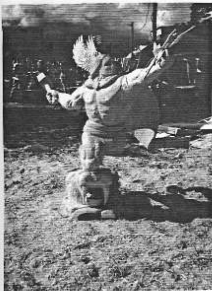
1st Place Judges Choice - Dennis Beach