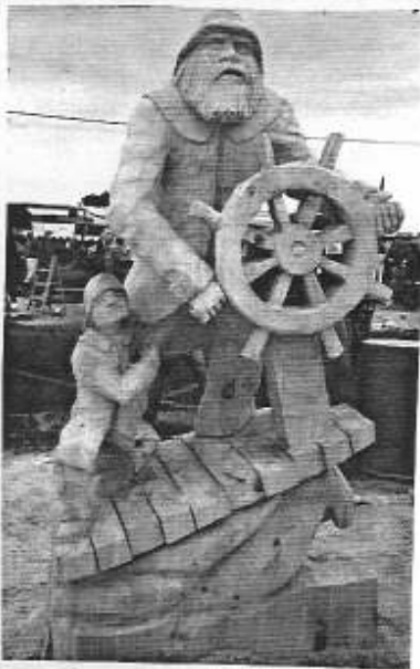
DON ETUE'S - SEA CAPTAIN - WINNER OF CARVER'S CHOICE, PEOPLE'S CHOICE AND 2nd IN JUDGES CHOICE

Cover Photos: Westport 1994 by Todd Foreman