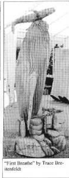
"First Breathe" by Trace Breitenfeldt