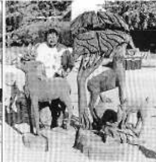
4th Place Deer