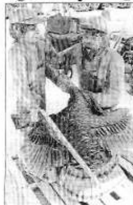
2nd Place: Dayton Scoggins